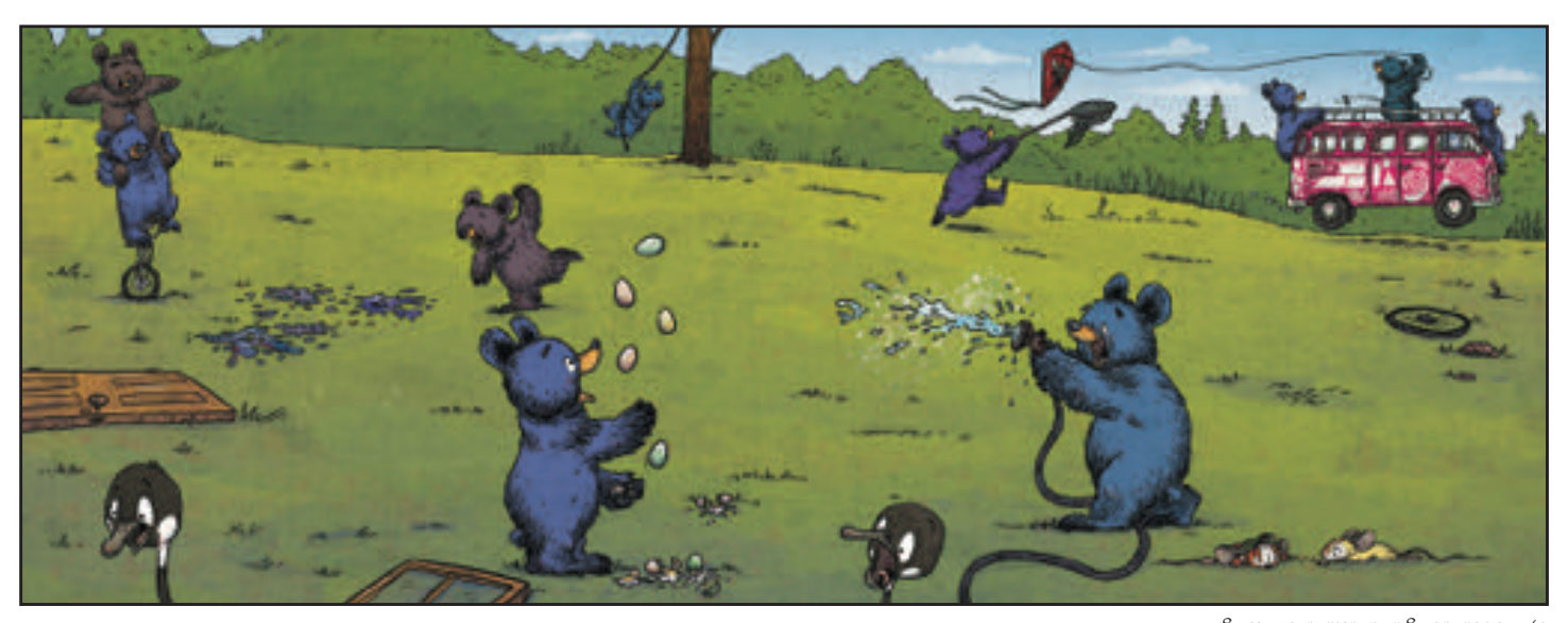
5) The bear doing a handstand is missing.