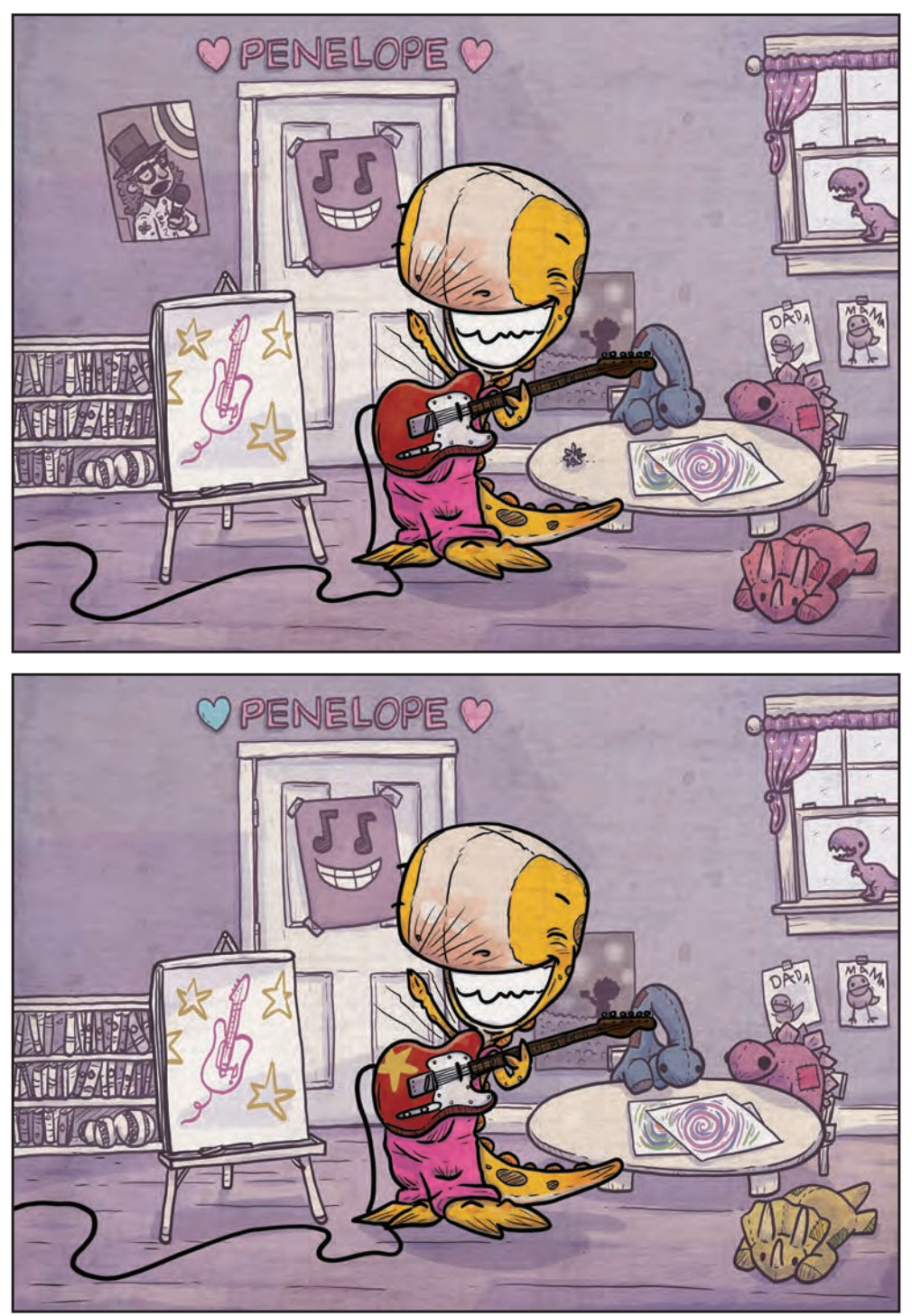
Answers: Heart color on the wall; Picture on the wall missing; Star added on guitar; Toy missing on table; Triceratops color.

Spot the five differences between the two images below.