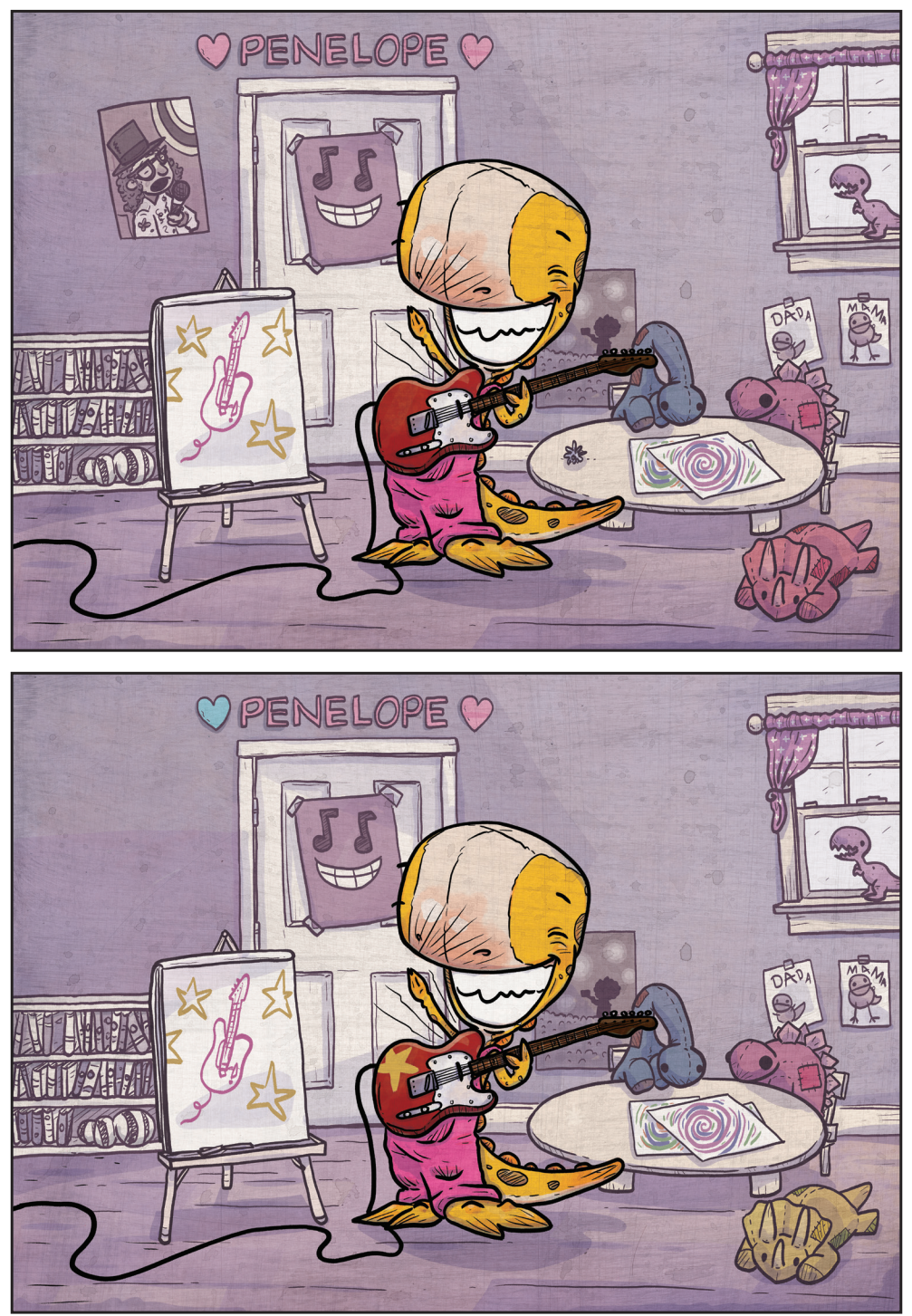
Answers: Heart color on the wall; Picture on the wall missing; Star added on guitar; Toy missing on table; Triceratops color.

Spot the five differences between the two images below.