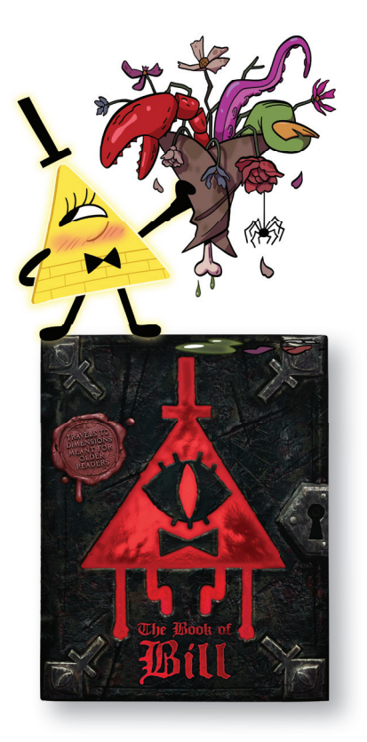
DISCOVER MORE IN The Book of Bill