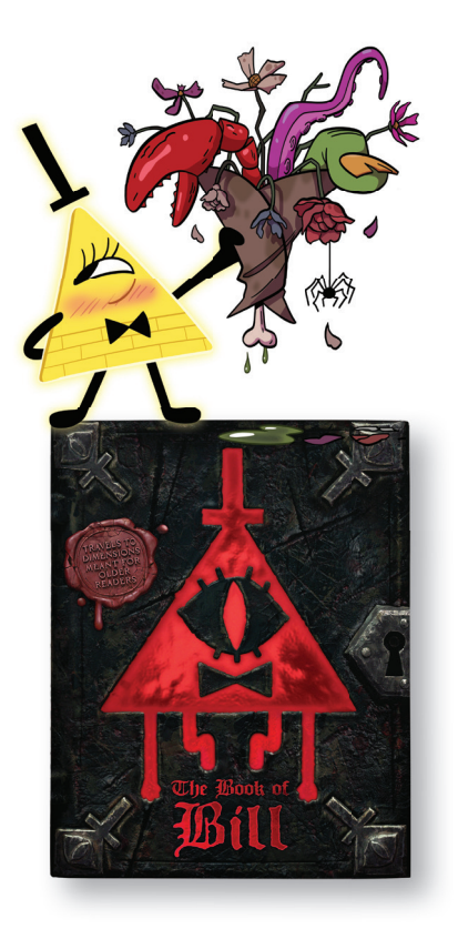
DISCOVER MORE IN The Book of Bill